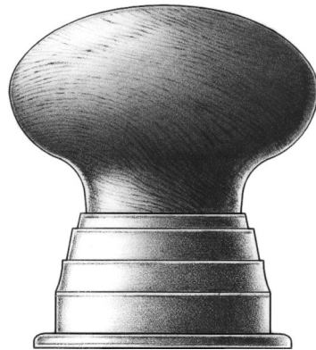
SIZE L 2 1/4 inch Diameter