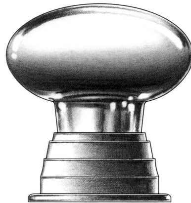
SIZE L 2\frac{1}{2} \times 1\frac{5}{8} inches