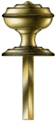
Thumb Turn & Rose