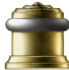
Cylindrical Floor Stop with Trim Ring