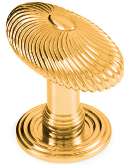
OLIVE 11200 ON ROSE 2