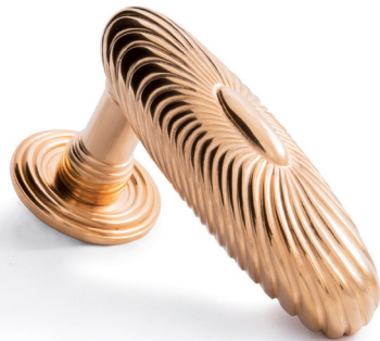
LEVER HANDLE 11200 ON ROSE